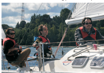
Good scholars, good sailors: the GS team outside Schilksee harbour.

The Graduate School sailing team was placed 4 th in the final round of the Alumni Cup 2010 on September 4 th . Two boats from business institutions and the former Ecology Centre yacht made it to the podium in Schilksee.